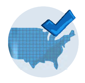
U.S. citizen or national