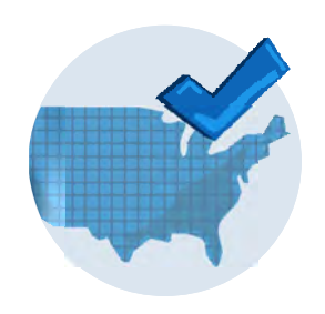
U.S. citizen or national