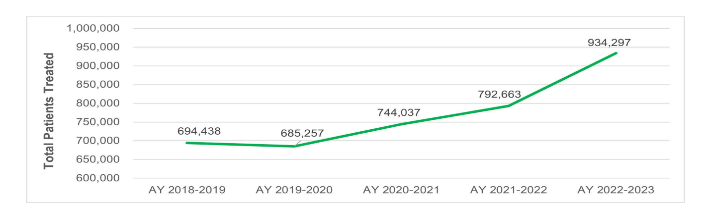
Figure 3. Total Unique Patients Treated by THCGME Residents, by Academic Year

Collectively, these figures reflect millions of patients in underserved areas who may not have received care without the residents supported through the THCGME program.